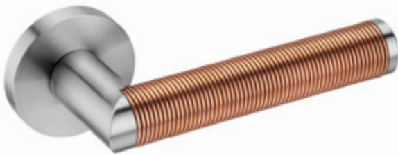
IN.00.406 LINK COPPER WIRE Puxador / Lever handle / Manilla RC08M (Roseta standard / Standard rose)