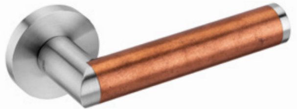
IN.00.409 LINK COPPER Puxador / Lever handle / Manilla RC08M (Roseta standard / Standard rose)